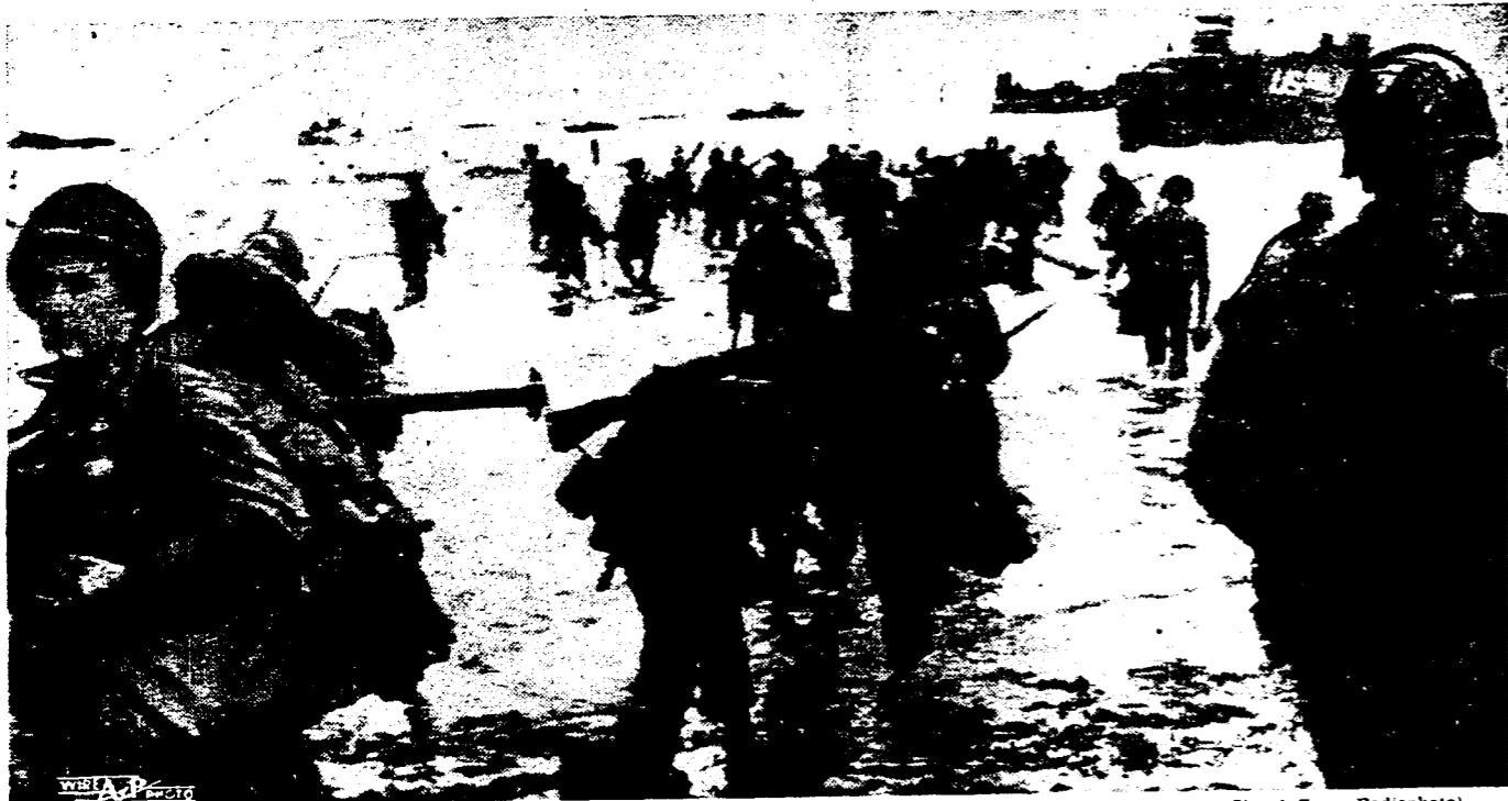
YANKS STORM ASHORE AT INVASION BEACHHEAD—United States assault troops, heavily laden with full equipment, push ashore on French coast as other landing craft follow theirs in.